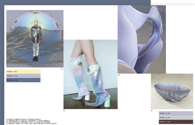
68 COLLOUR FORECAST